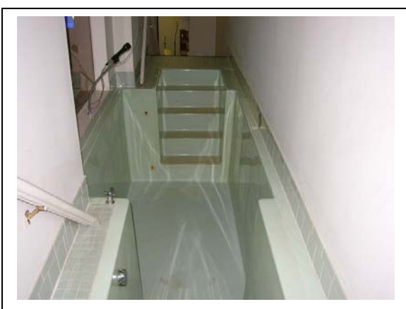
This photo illustrates a corded microphone installed in the baptistery. The risk of electrocution is present for anyone in the baptistery who could contact the microphone. The microphone in this photo should be relocated and suspended from the ceiling or replaced with a cordless microphone.