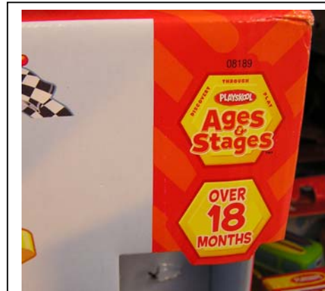
This photo an example of a toy's packaging showing recommended ages for the toy.