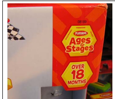
This photo an example of a toy's packaging showing recommended ages for the toy.