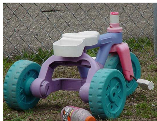
Damaged toys, such as this big wheel, need to be repaired back to their original condition or removed from the play area and thrown away.