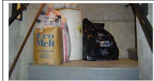
This photo is an example of materials being stored on a stair landing. Storing items on stair landings restricts the walkway, increasing the chances of slips and falls to occur.