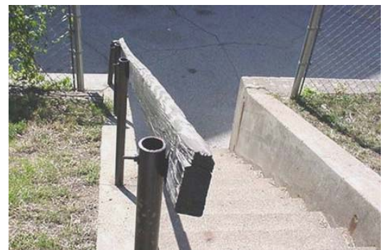
This photo is an example of an inadequate handrail in terms of design. The handrail has poor grasp ability, sharp corners and protruding bolts holding the handrail to the support posts.