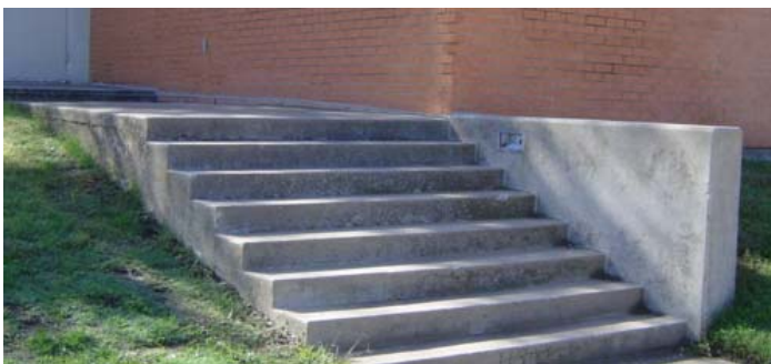
This photo is an example of exterior steps that are in good condition; however, the stairs have more than four risers, so they should be equipped with an appropriate handrail.