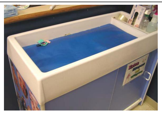
This photo is an example of a safe changing table equipped with four sides and an appropriate storage area.