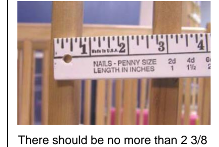
There should be no more than 2 3/8 inches between crib slats

Neither the headboard nor footboard should have cutouts where the baby's head could become entrapped.