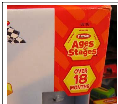
This photo an example of a toy's packaging showing recommended ages for the toy.