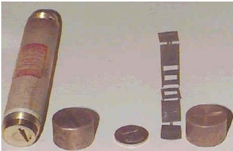
This image shows a renewable fuse and its components. The element is inserted into slots on the top and bottom of the fuse, and the threaded caps screw on and apply pressure to the element.