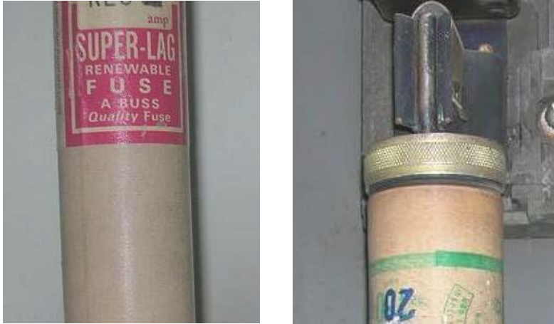
A renewable fuse is a cartridge style fuse that can be identified by labeling (image on left) and/or by the end caps that can be unscrewed (image on right)

A renewable fuse is a cartridge-style fuse. If the fuse is blown, the cap is unscrewed, and the link can be replaced, allowing the fuse to be reused. Once the link has been replaced, the mechanical connection between the link and the fuse cap can become loose, dirty, corroded or otherwise faulty, resulting in a connection that can generate heat in the hundreds of degrees and cause the insulation on the conductor to deteriorate. Once the conductor makes contact with the metal of the panel or the conduit, a short circuit occurs, which can result in arcing and fire. Renewable fuses should not be used and should be replaced with one-time use standard fuses.