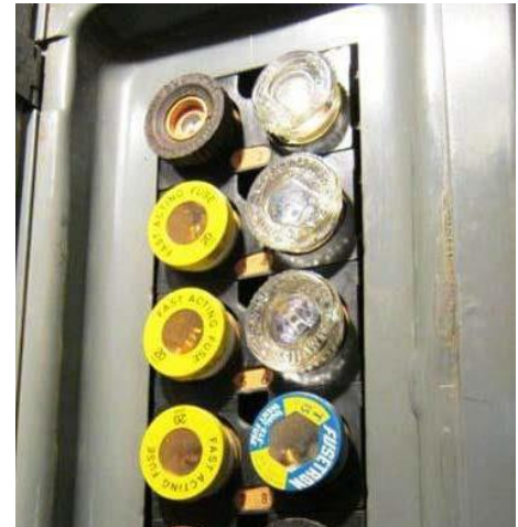
Typical screw-in fuse panel.

Fuses can be safe, however, it is recommended that fuses be replaced and updated to circuit breakers. If this is not feasible, the following safety precautions should be followed: