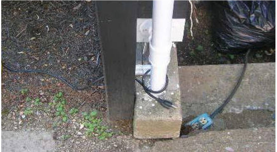
This image shows an outdoor wiring installation that is not a GFCI protected receptacle.

Churches without GFCI receptacles installed in these specific locations should have this completed. For broader protection, consider GFCI circuit breakers to replace ordinary circuit breakers. For churches protected by fuses, you are limited to receptacle-type GFCIs, and these should be installed in areas having the highest exposure to a water source such as kitchens, bathrooms and outdoor circuits. To further protect church employees and volunteers from electric shock, GFCI protection should be provided when electric powered equipment is used. This would include items such as hedge trimmers, leaf blowers, lawn edgers, and hand-held power tools.