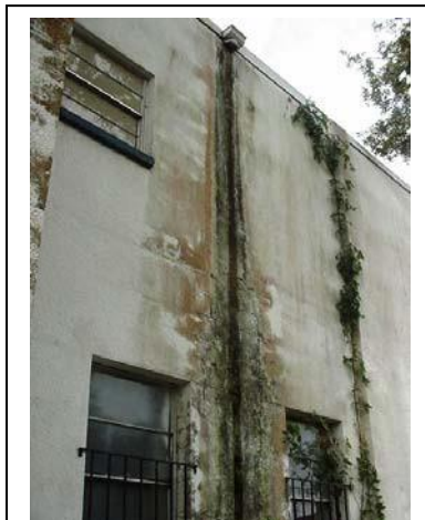
This photo illustrates a missing downspout. The water damage to the building includes algae growth and cracks in the brick walls. Regular inspections looking for missing downspouts would have prevented this condition.