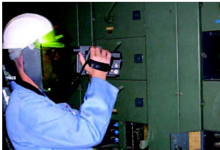
Infrared thermographers look for hot spots that could indicate loose connections and other electrical problems.